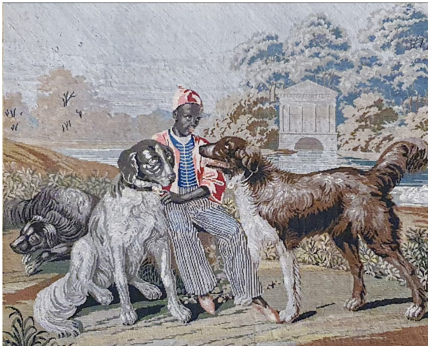
Britain, Moroccan boy with setters, c.1880, Britain, petit point, wool on canvas back cloth. TDRF 1580

"Highlights of his travels were the modern architecture of Madrid, a visit to caves outside Granada to see Spanish gipsies dance, wonderful skiing at St. Moritz, and the fabulous hospitality of American hosts who sent a plane to bring a guest from New York to Boston to save a train journey".