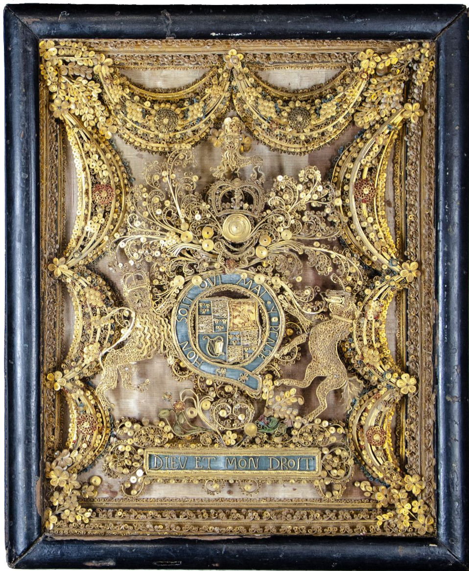
Britain, Queen Anne English coat of arms quilling, 1702–07, Britain, paper, foil, gold leaf, silk, wood. TDRF 3968