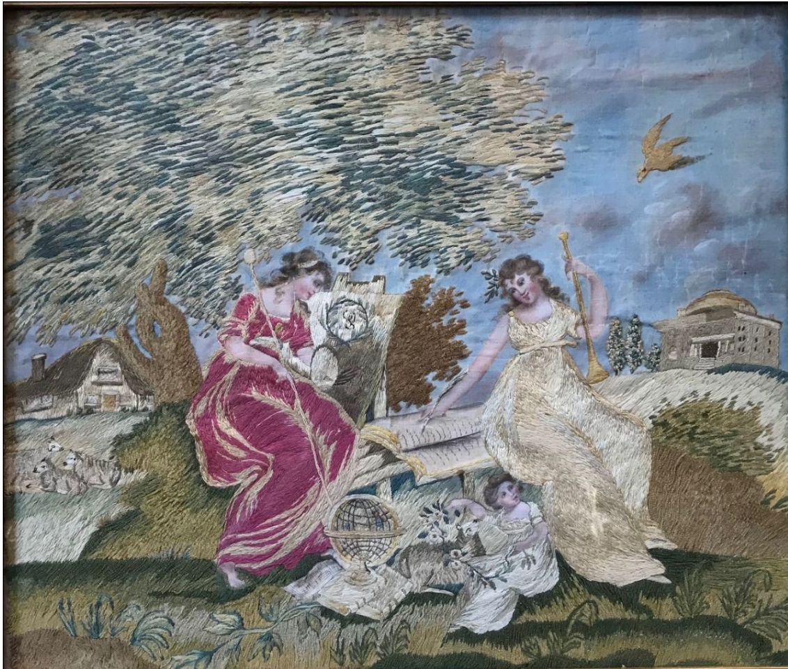
Georgian period, Britain, The Muses (Goddesses of literature, science and the arts), 1780–1820, silk on painted linen. On loan from a private collection.

In: Embroidery: Oppression to Expression.