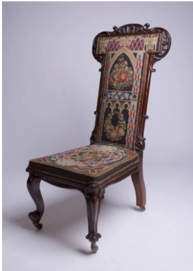
Britain, Prayer chair , c.1880, Britain, Brazilian rosewood, embroidered wool on canvas panels.