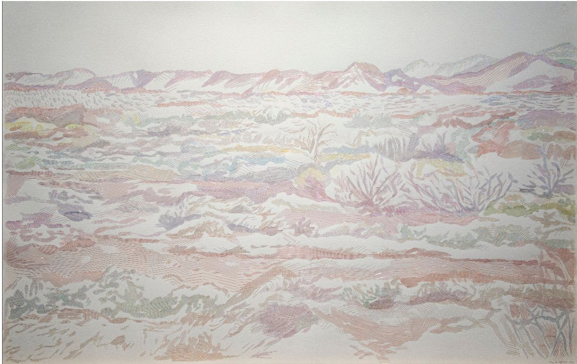
Amy Joy Watson (Australia b.1987), Parachilna 2 , 2021, watercolour and metallic thread on paper.

People have been raving about our latest exhibition, Embroidery: Oppression to Expression . Here's just some of the comments that visitors have made: