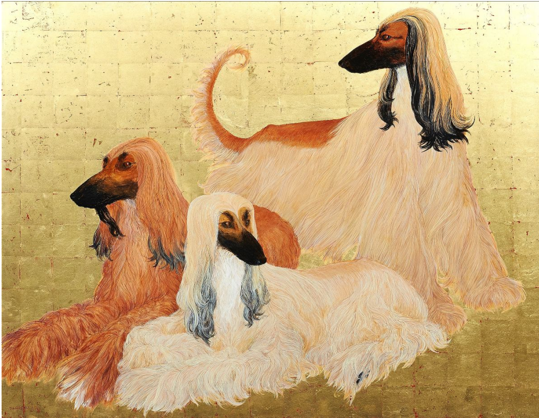
Donald H. Green (Australia b.1939), Fermoy Kennels afghan hounds , 1972, Adelaide, oil on masonite, gold leaf, 107.0 x 137.0 cm.