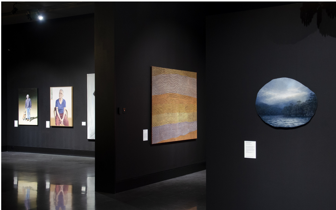
Salon des Refusés 2021 at TDRF