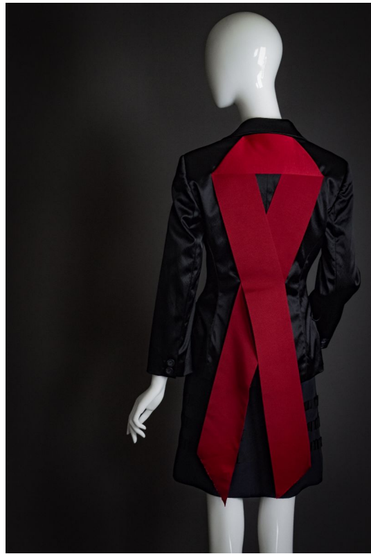
Left image: Chester Weinberg (USA 1930–1985), Evening dress, 1968, silk, satin, On loan from a private collection, Adelaide