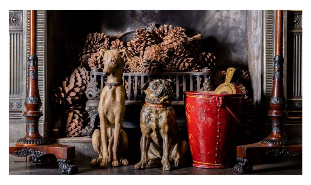
Image: In these cool months, warm your body and your mind with a tour of Fermoy House.