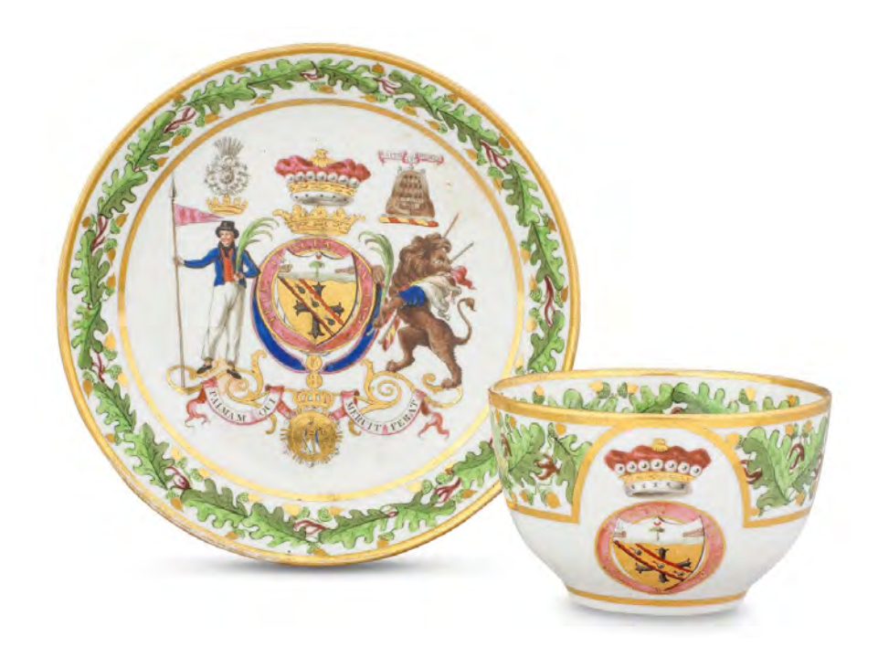
Image: Coalport Porcelain Works, Breakfast cup and saucer (from the Nelson Set Breakfast Service) c.1802, hard-paste porcelain, polychrome enamel, glazed, gilt.

The Foundation is pleased to have acquired a distinctive cup and saucer from the 'Nelson Set' Breakfast Service. It features an impressive hand-painted and gilt armorial centered on the augmented English arms of Nelson, surrounded by a border of green oak leaves and gold acorns. The armorial contains the crest of the Chelengk, referring to the diamond chelengk presented to Nelson by Sultan Selim III of Turkey after the Battle of the Nile in 1798; and the crest of the San Josef, the Spanish three-decked battleship which was captured by Nelson in 1797 and subsequently made his flagship.