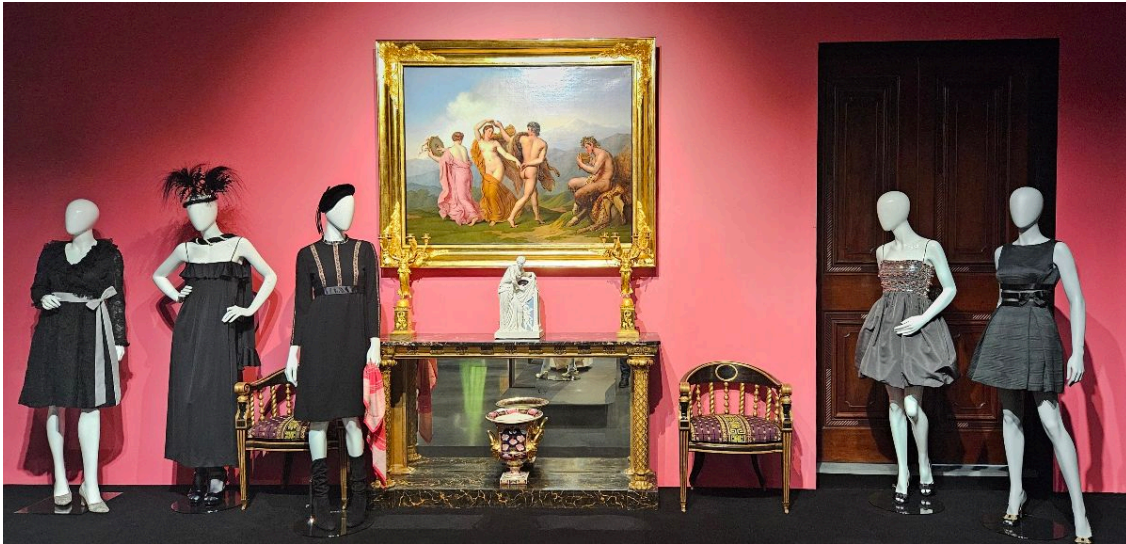
Image: Style & Spirit pairs garments by Chester Weinberg with spectacular works of art from the David Roche Collection.