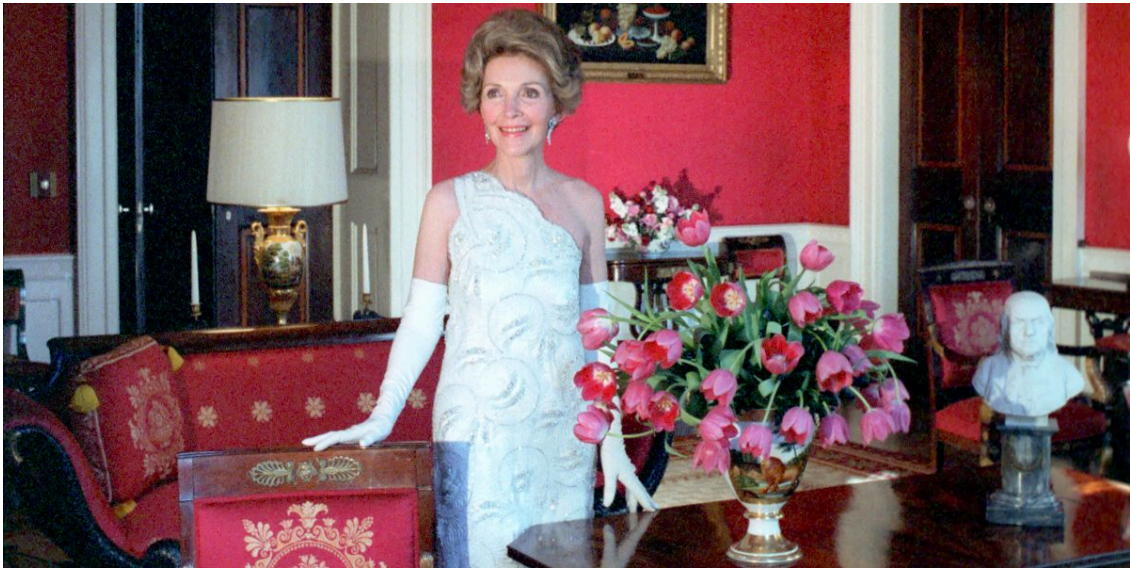
Image detail: Nancy Reagan in the red room of the White House during a photo session with Vogue magazine, 4 February 1981.